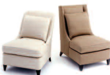
Donghia, Suite C-250