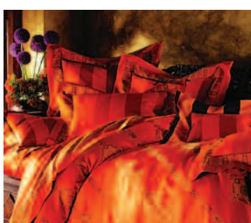
Anichini, Suite C-170

New Tenants and Renewals Continue Strong Expansions Reflect Impressive Growth