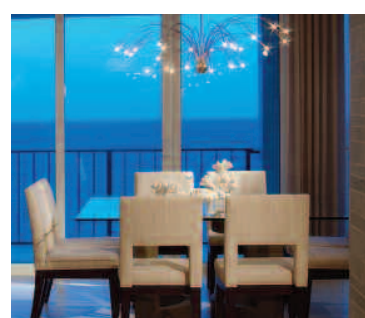
Vero Design, Suite B-464